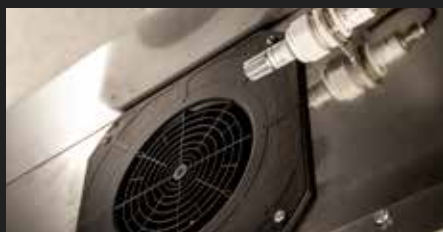
Fans run on demand to save energy and provide the perfect proving climate.