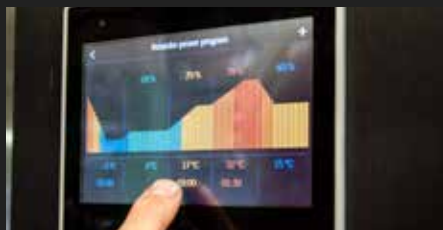
User-friendly touch function control panel simplifies everyday life.

Choice of colors: Neutral stainless steel or black.