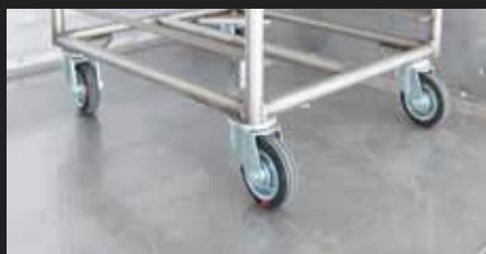
Insulated heated floor that prevents cold damage to underlying materials.